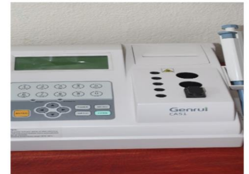
Mini Hematology Analyzer